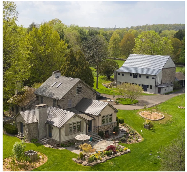
Drumbore Farm: A gathering place.

Interested in becoming a sponsor? Email us: info@turnbucksblue.com