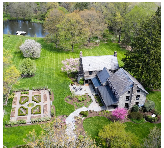
Black Horse Farm: Living deliberately